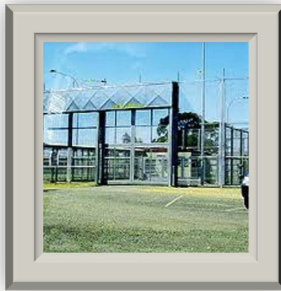
Yatala Labour Prison

'The Sovereign Lord has filled me with His Spirit. He has chosen me and sent me to bring Good News to the poor, to heal the broken-hearted, to announce release to the captives, and freedom to those in prison.' Isaiah 61:1 (GNB)